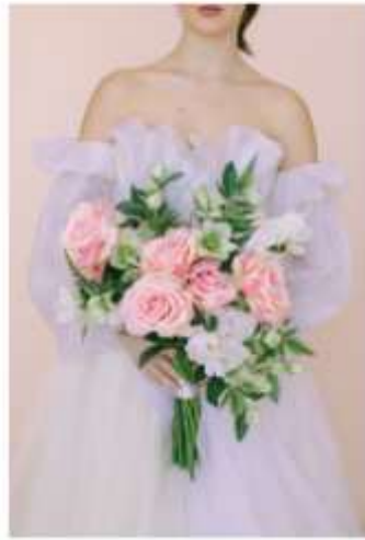
Bridal Bouquet (Garden-cut)