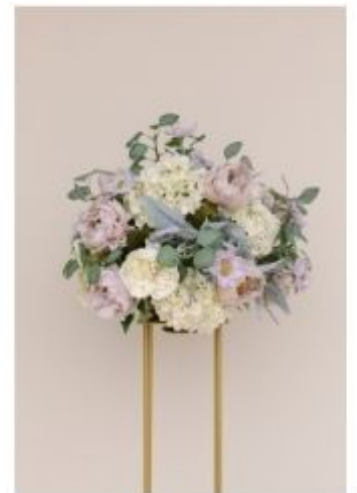
Grand Centerpiece *Stand rented separately