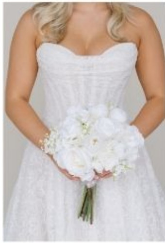
Bridal Bouquet (Round)