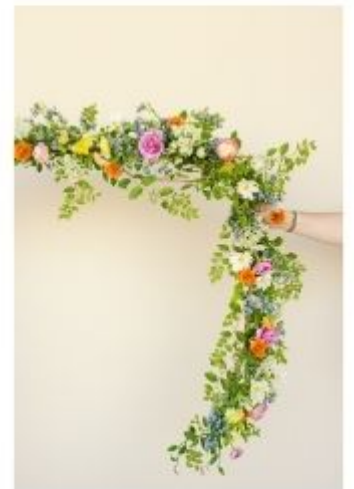
Floral Garland (Wisteria)

Collection also includes: Aisle Marker, Hair Accessories, Dog Collar, Cake Flowers, and a Pomander Ball.