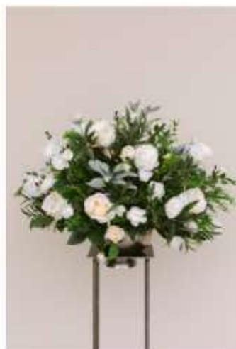
Grand Centerpiece *Stand rented separately