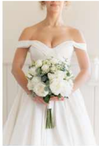
Bridal Bouquet (Round)