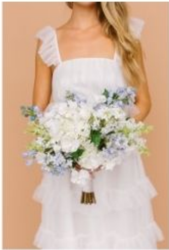
Bridal Bouquet (Hand-tied)