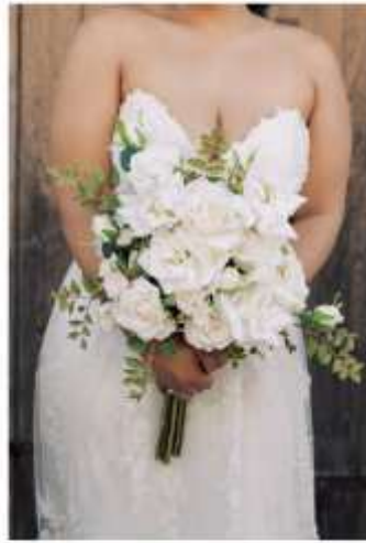
Bridal Bouquet (Blanc)