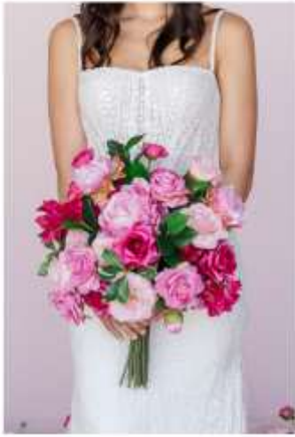
Bridal Bouquet (Hand-tied)