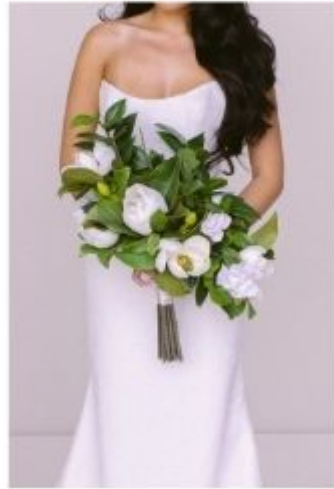
Bridal Bouquet (Garden-cut)