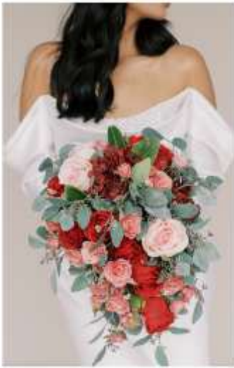
Bridal Bouquet (Cascading)