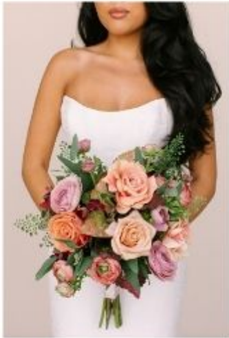
Bridal Bouquet (Hand-tied)