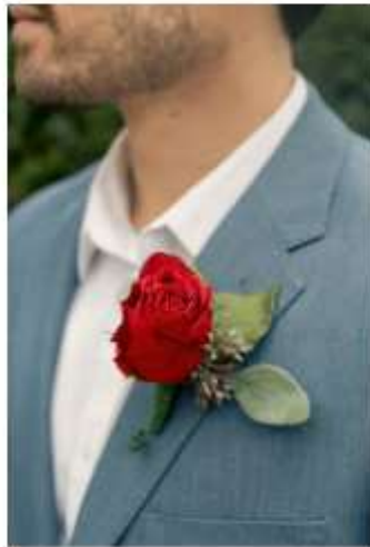
Boutonniere (Red Rose)