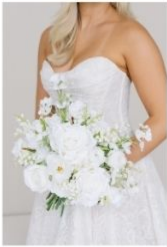
Bridal Bouquet (Hand-tied)