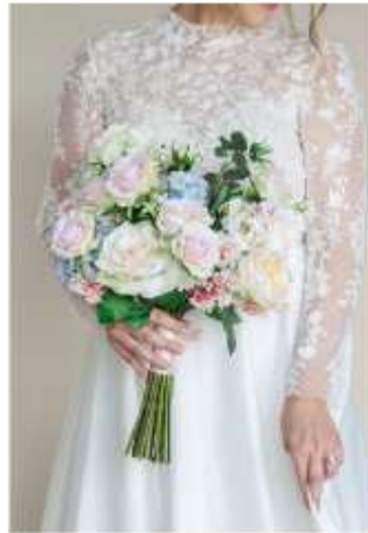
Bridal Bouquet (Garden-cut)