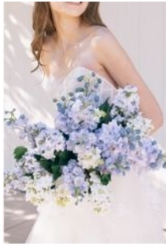
Bridal Bouquet (Garden-cut)