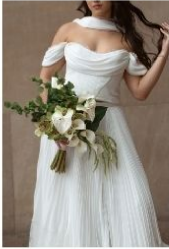
Bridal Bouquet (Hand-tied)