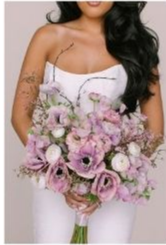
Bridal Bouquet (Blanc)