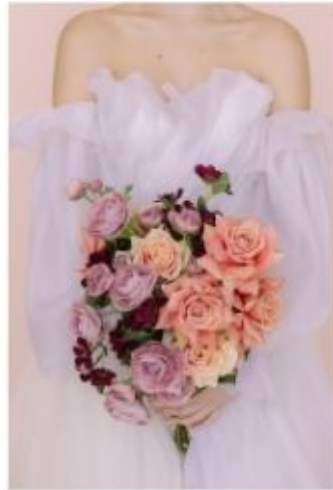
Bridal Bouquet (Garden-cut)