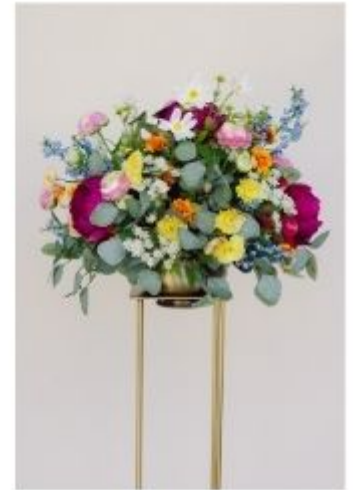
Grand Centerpiece *Stand rented separately