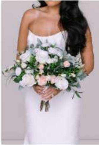
Bridal Bouquet (Hand-tied)