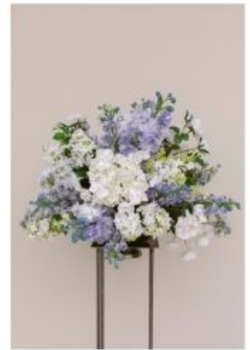
Grand Centerpiece *Stand rented separately