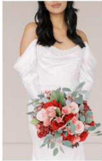
Bridal Bouquet (Round)