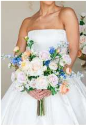
Bridal Bouquet (Hand-tied)