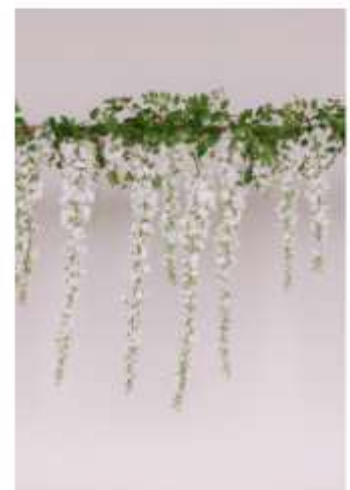
White Wisteria Garland

Collection also includes: Aisle Marker, Boutonnieres, Hair Accessories, Dog Collar, Cake Flowers, and a Pomander Ball.