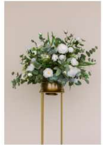
Grand Centerpiece *Stand rented separately