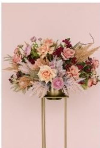
Grand Centerpiece *Stand rented separately