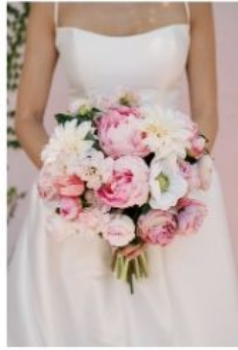
Bridal Bouquet (Round)