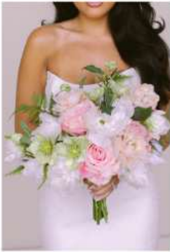
Bridal Bouquet (Hand-tied)