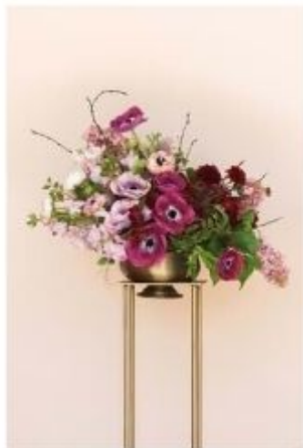
Grand Centerpiece *Stand rented separately