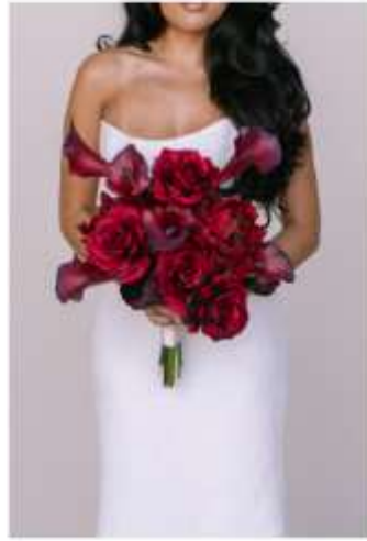
Bridal Bouquet (Rouge)