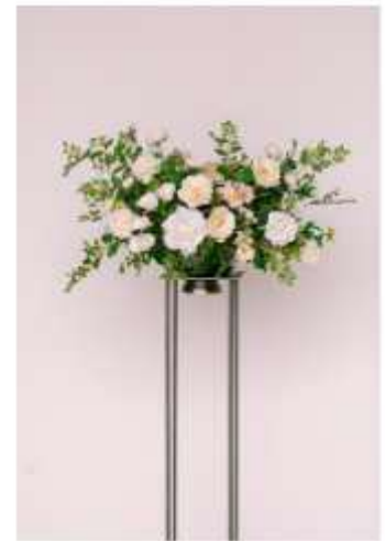
Grand Centerpiece *Stand rented separately