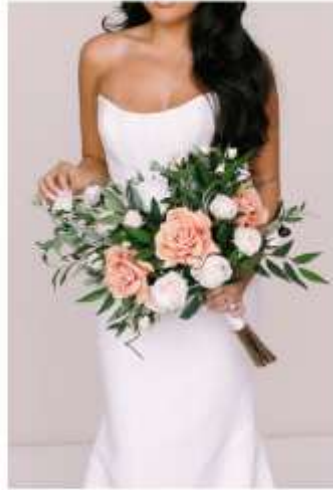
Bridal Bouquet (Garden-cut)