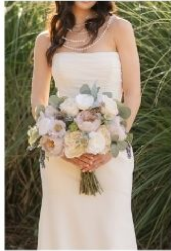
Bridal Bouquet (Hand-tied)