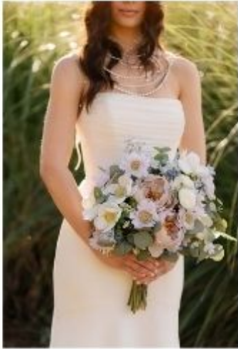
Bridal Bouquet (Round)