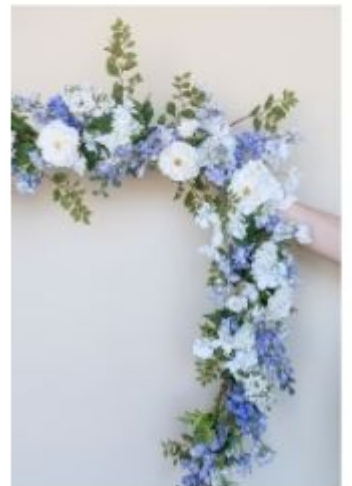
Floral Garland (Wisteria)

Collection also includes: Aisle Marker, Hair Accessories, Dog Collar, Cake Flowers, and a Pomander Ball.