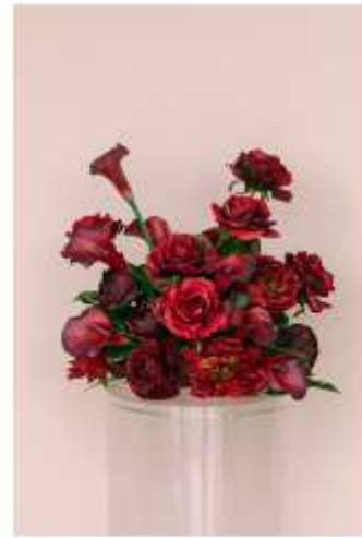
Lg. Vaseless Centerpiece