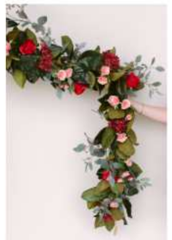
Floral Garland (Magnolia)

Collection also includes: Hair Accessories, Dog Collar, Cake Flowers, and a Pomander Ball.