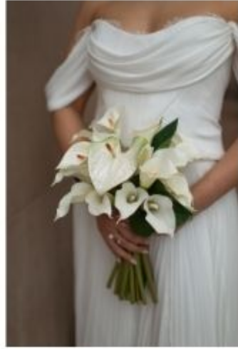
Bridal Bouquet (Blanc)