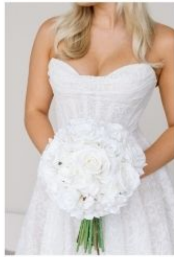
Bridal Bouquet (Classic)