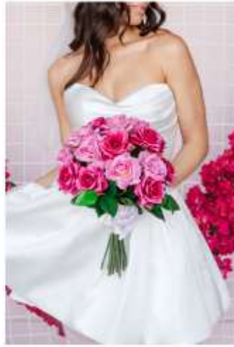
Bridal Bouquet (Round)