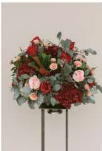
Grand Centerpiece *Stand rented separately