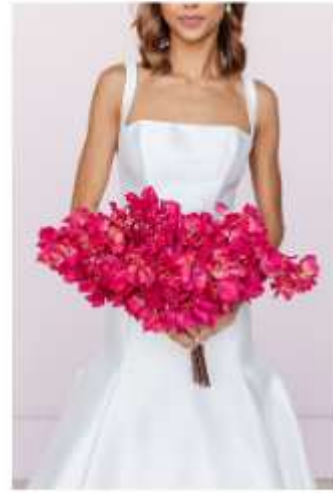
Bridal Bouquet (Bougainvillea)