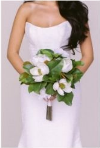
Bridal Bouquet (Hand-tied)