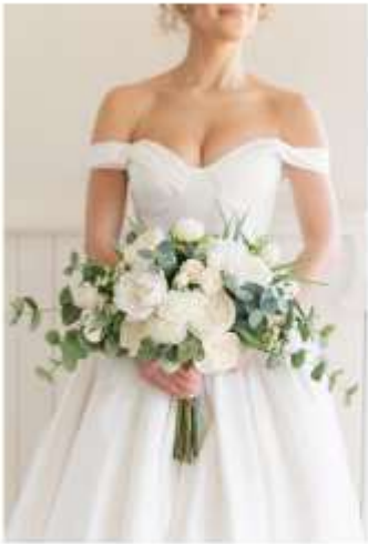
Bridal Bouquet (Hand-tied)