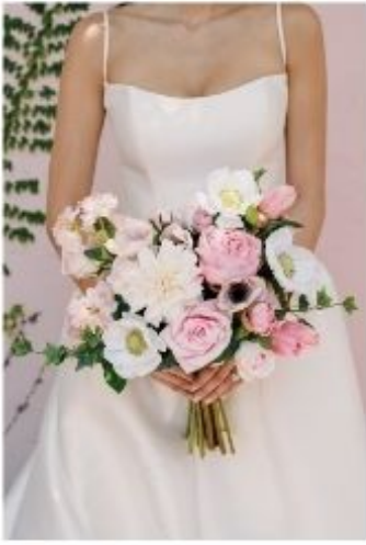
Bridal Bouquet (Hand-tied)