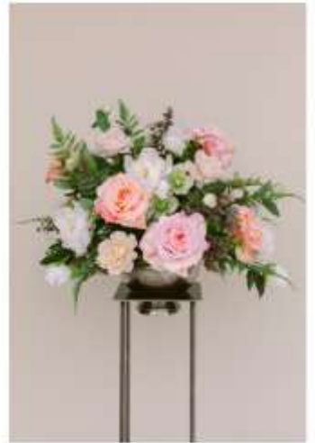
Grand Centerpiece *Stand rented separately